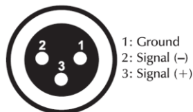
DMX-output XLR mounting-socket: